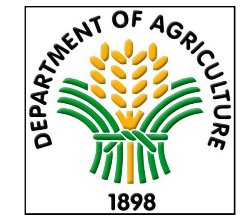
Opinion of the Department of Agriculture (DA)<sup>8</sup>

Always remember that in rice smuggling, the problem is the clash between domestic laws and an international agreement, in this case the WTO. In the event that the exporting country feels aggrieved in the importation procedure of the Philippines and decided to bring the case before the WTO arbitration tribunal, would such foreign tribunal uphold our government's position?